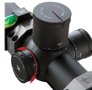
Adjust the side parallax knob

Parallax is a phenomenon that results when the target image does not quite fall on the same optical plane as the reticle within the scope. When the shooter's eye is not precisely centered in the eyepiece, there can be apparent movement of the target in relation to the reticle, which can cause a small shift in the point of aim. Parallax error is most problematic for precision shooters using high magnification.