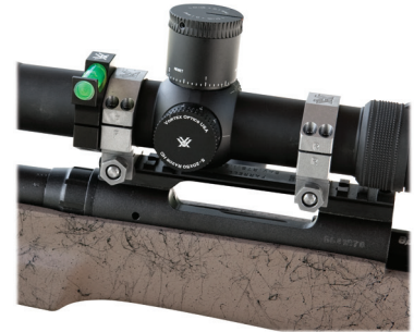
Use 35mm rings for the Razor 5–20x50

Vortex Optics highly recommends using the matched Vortex Optics Omega 35mm precision ring sets which may be purchased from an authorized Vortex riflescope dealer. These rings will mount to any quality Weaver or Picatinny type base.