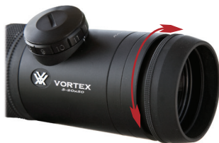
Adjust the reticle focus

Try to make this particular adjustment quickly, as the eye will try to compensate for an out-of-focus reticle.