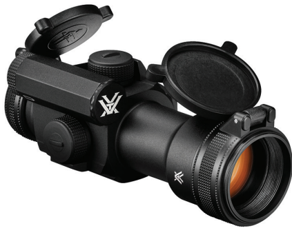
Low Ring Mount Option (21 mm Height)